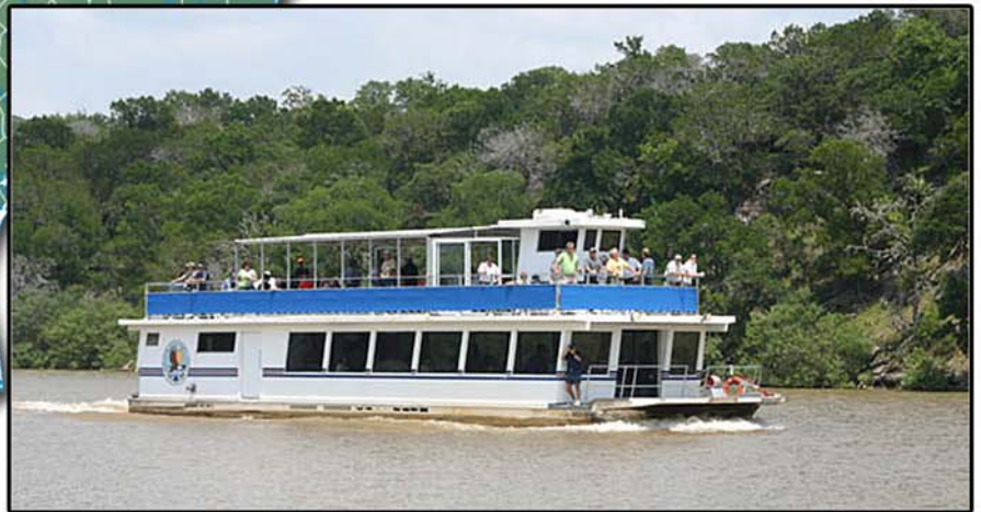
ABOARD THE AMERICAN BALD EAGLE CRUISE

includes transportation, private chartered cruise, box meal with dessert and tea or water