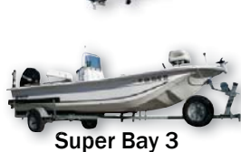
Super Bay 3