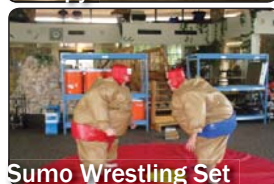
Sumo Wrestling Set