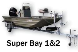
Super Bay 1&2