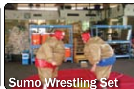
Sumo Wrestling Set