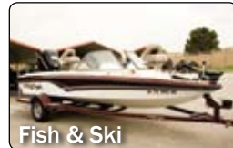
Fish & Ski